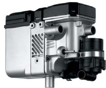
Webasto Thermo Top C Compact design, variable temperature control, service-friendly technology and low noise levels.

Depending on how it is incorporated, this system can also be used to provide heated air throughout the living area, so you can enjoy precisely the level of cosy warmth you want at little additional cost.